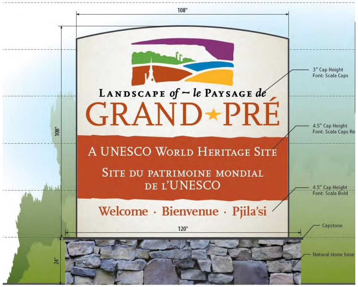
UNESCO World Heritage Site Arrival FRONT ELEVATION

implementing the wayfinding and brandmark programme promoting and advertising the World Heritage Site